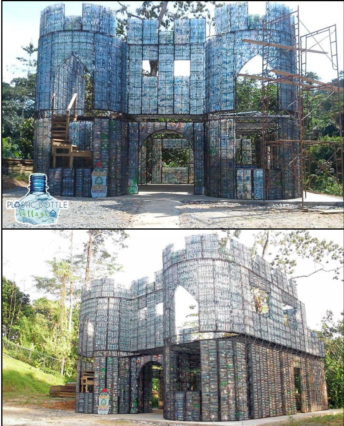
FIGURE L: Plastic village house by Isla Colon (Panama), 2016.

Effective sustainable design solutions comply with the principles of social, economic and ecological sustainability.