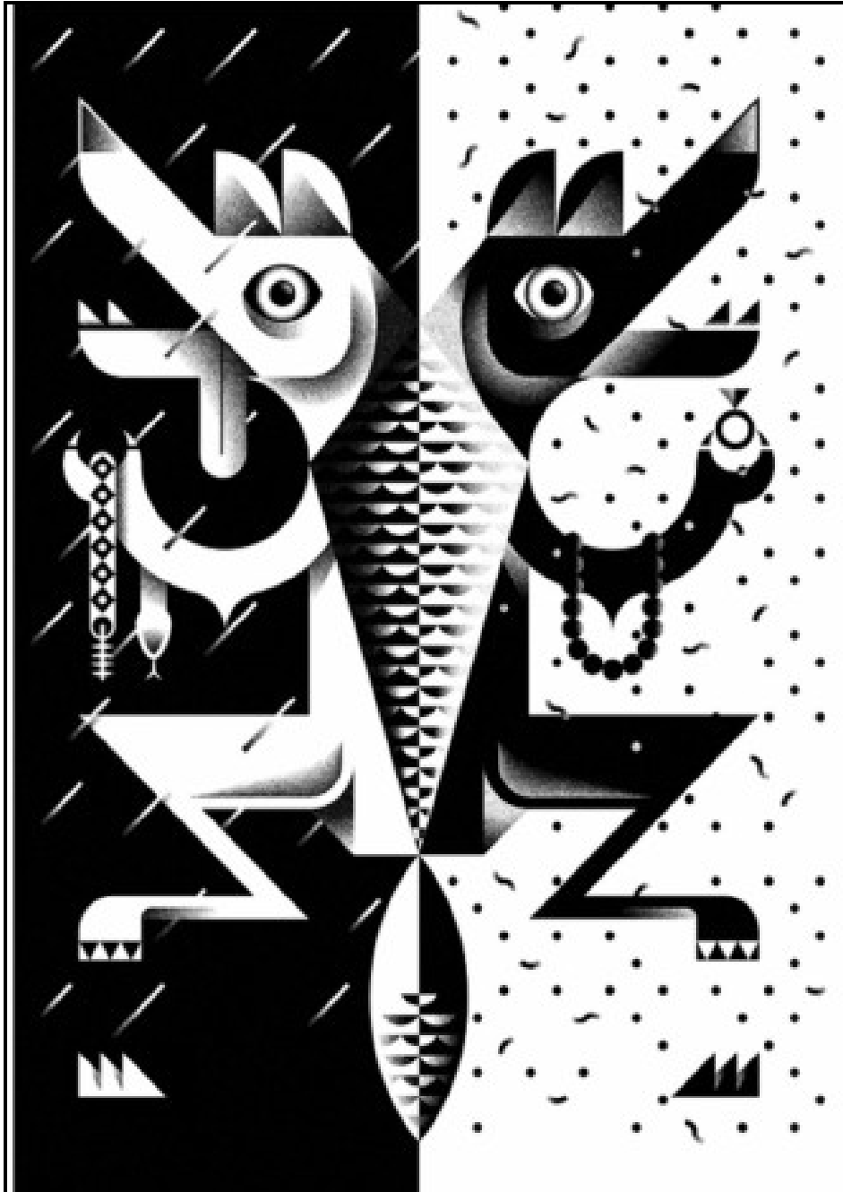
FIGURE B: How the Birds Chose a King (design illustration) by Jono Garrett (Johannesburg), 2015.

1.2.1 Analyse and discuss the use of the following in relation to FIGURE B: