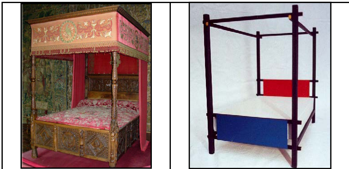
FIGURE H: Renaissance bed.