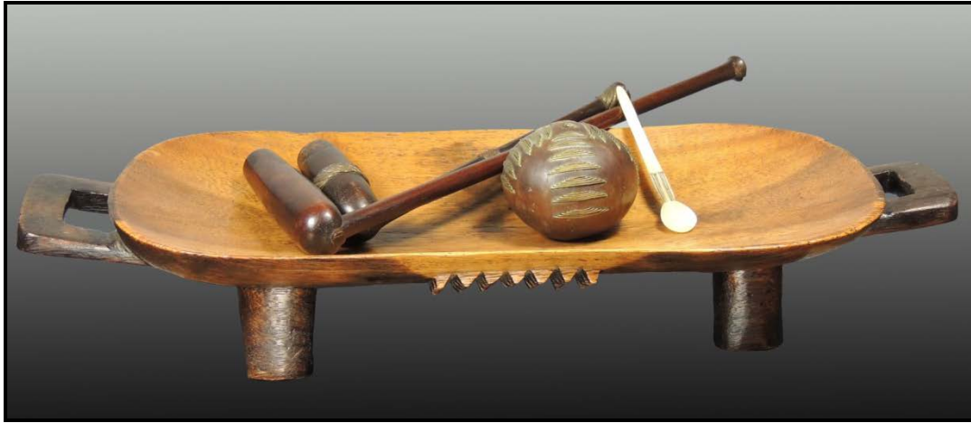
FIGURE K: Traditional Nguni products (South Africa), 1985.

5.2.1 Do you think the traditional products in FIGURE K are still useful today? Give reasons for your answer. (2)