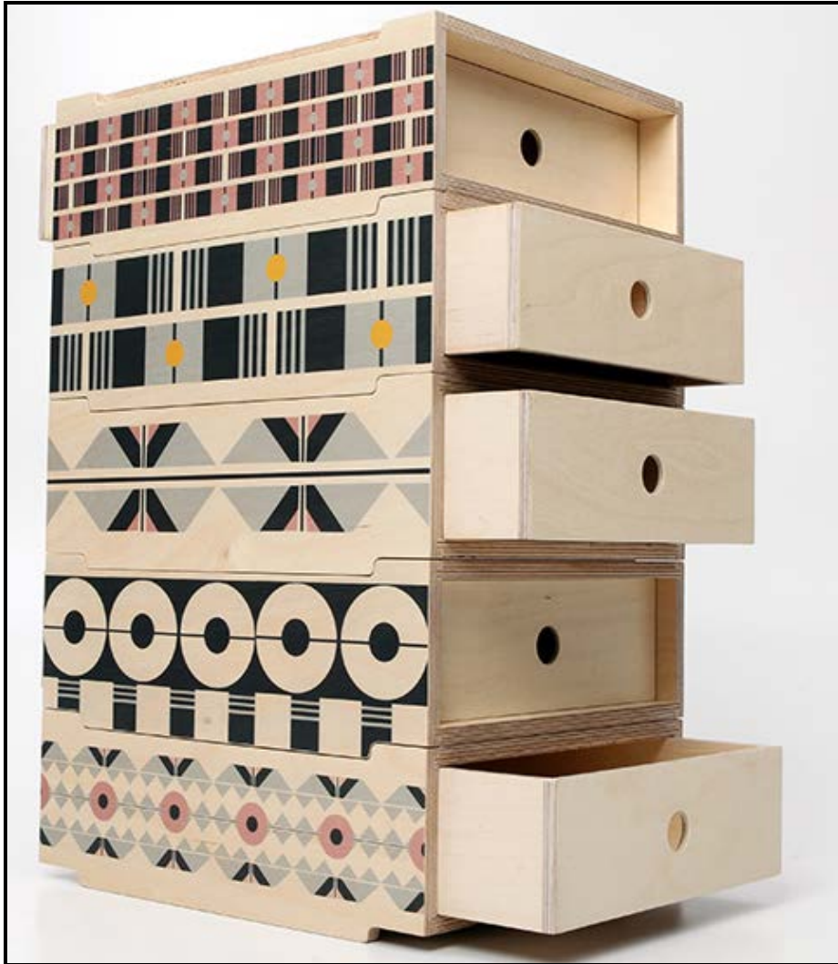
FIGURE A: Chest of drawers by Renée Rossouw and Deáanne Viljoen, De Steyl Studio (South Africa), 2015.

1.1.1 Analyse and discuss the use of the following elements and principles of design in relation to FIGURE A: