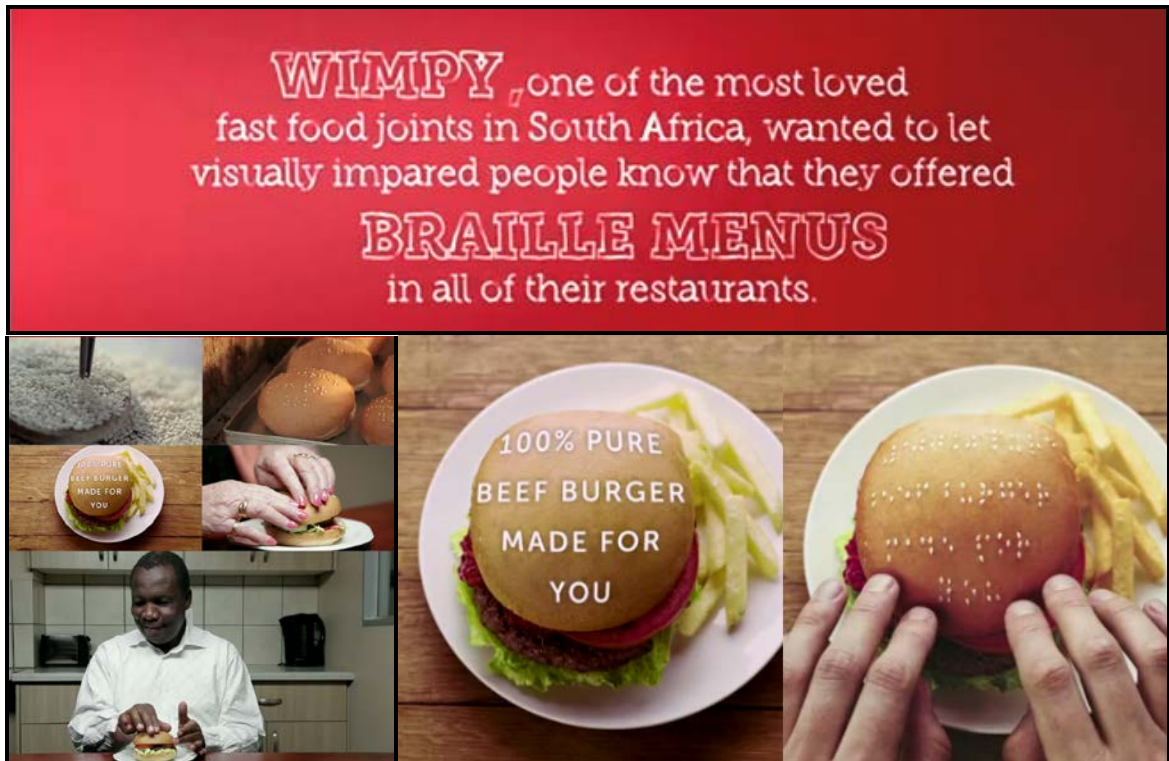
FIGURE J: The Wimpy Braille Campaign by Metropolitan Republic (South Africa), 2016.